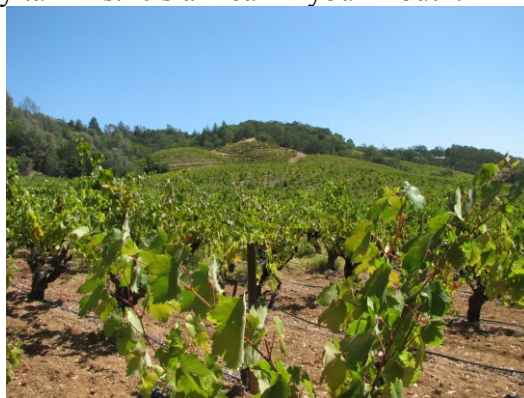
90 year old vines at Carreras Vineyard

Tasting notes: The '08 Zinfandel is bold and full bodied with dark cherry fruit and mocha. With flavors of blackberry and licorice, the wine is rich and chewy in the middle, finishing with big, fleshy tannins. It's a meal in your mouth.